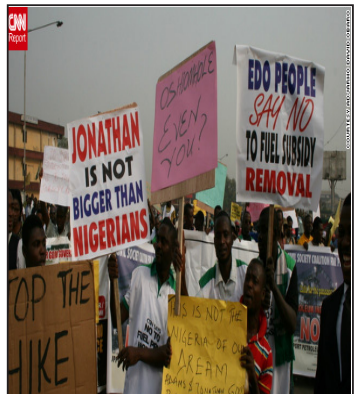
Figure 7 Figure 8 Figure 9